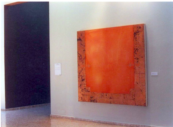
Photo from Stefan Umærus' one-man exhibition "Anatomía del Mundo, Documentos Para La Vida Pública 2000" at the Museo de Arte Moderno, Santo Domingo, 2000.