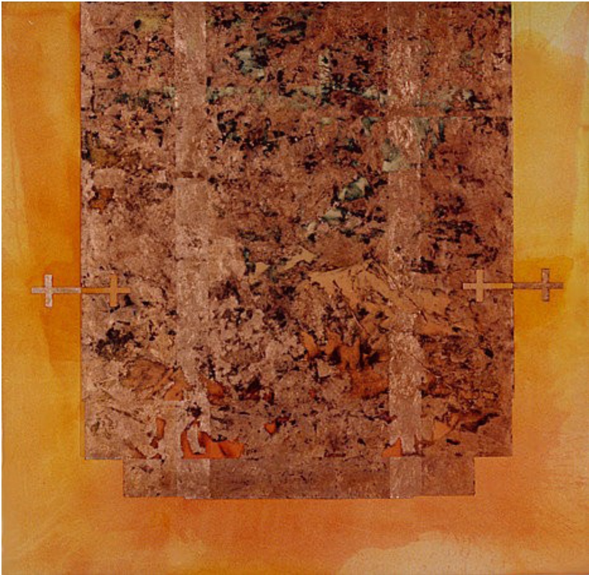
"The Anatomic Theatre/ The World, North" Stefan Umærus, 1995 Oil, copper-leaf, gouache on canvas 71"x71" (180 cm x 180 cm)