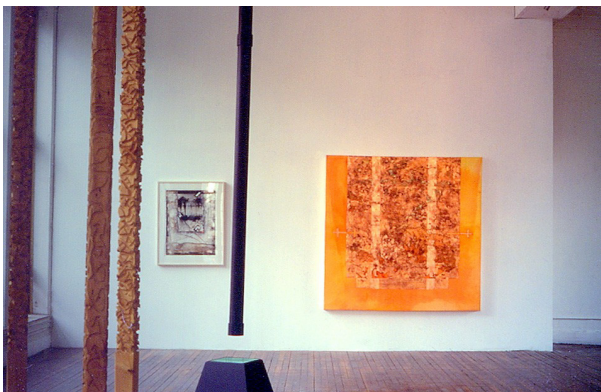
Photo from the exhibition "A Tribute to Ingmar Bergman" , organized by the American Scandinavian Society in New York, 1995.